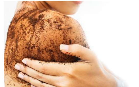
60 Mins. Body Scrub

60 Minutes 2,000,000 VND 90 Minutes 2,500,000 VND