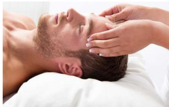
60 Mins. Sunburn Soother

Cool lavender infused towels with soothing aloe vera extracts is applied to moisturize and encourage new cell growth. It includes foot acupressure or scalp massage.